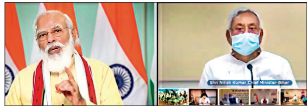
Screen grabs posted by PM Narendra Modi on Twitter, of a video conference whereby he inaugurated three petroleum projects in Bihar on Sunday