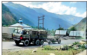
An army convoy carrying tanks moving towards Ladakh on Sunday

Xi, 67, already roiling the Communist Party with a "rectification" campaign and mass persecution of foes, will launch "another brutal purge" following the Chinese army's failures on the Indian border, the News-