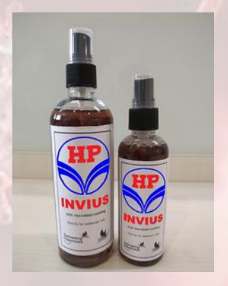
Coated with HP INVIUS